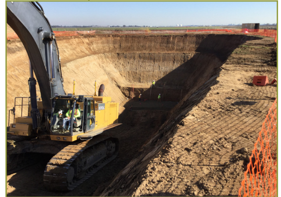
New Growth Area Infrastructure Project 2018