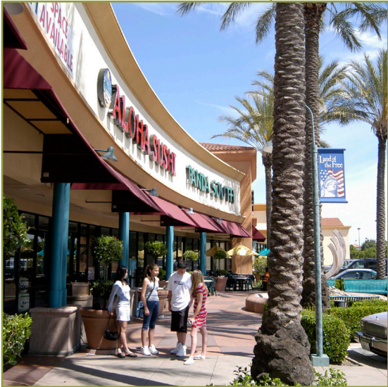
Commerce in Elk Grove