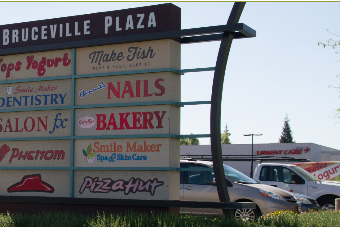
Commerce in Elk Grove

Our Regional Neighbors Know Us & Our Contributions. This principle speaks to Elk Grove’s place and function within the larger Sacramento region, and relationship to nearby regions such as San Joaquin Valley, the San Francisco Bay Area, and Silicon Valley. Since the economy in Elk Grove is strongly influenced by regional factors and trends, the policies in this chapter aim to enhance the City’s prominence in the regional economy in a variety of ways. These include establishing a major regional employment center in Elk Grove pursuant to the regional transportation and land use strategy (discussed in further detail on pages 5-8 and 5-9); improving coordination between the City and regional agencies and organizations on economic development matters; and strengthening Elk Grove’s linkages to the regional transportation network to support local economic development.