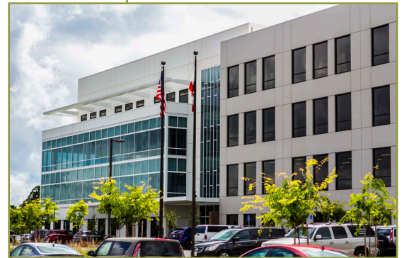
Office in Elk Grove