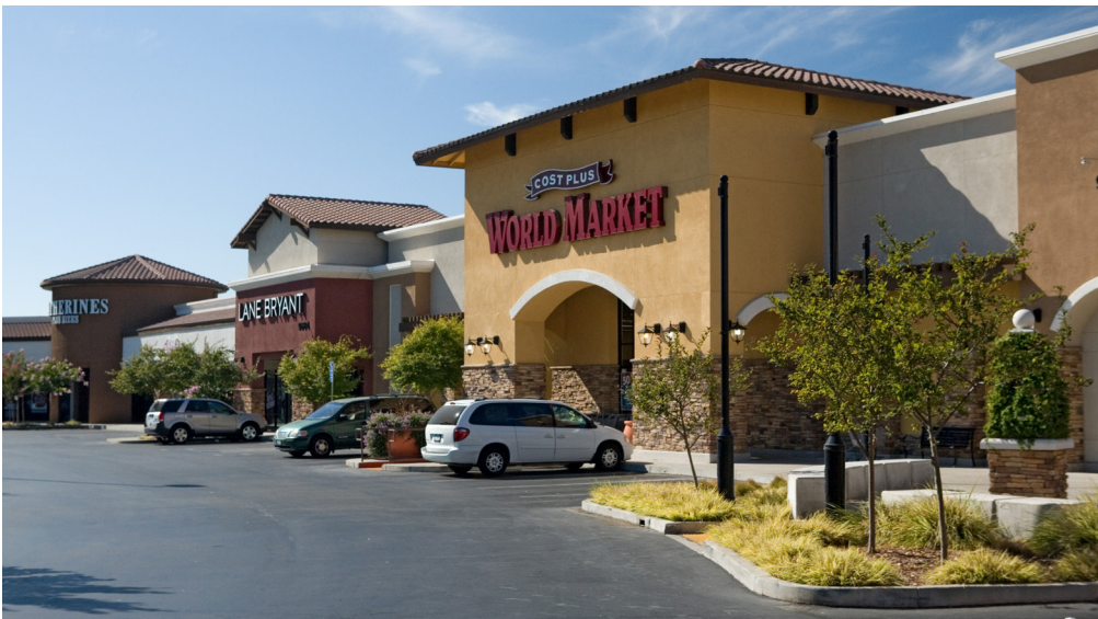
Commerce in Elk Grove