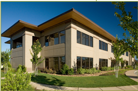
Office in Elk Grove

A healthy and sustainable economy is a critical component of Elk Grove’s overall well-being and enables City government to achieve and sustain community goals, such as enhanced resident employment options, reduced commute times, and an overall higher quality of life through the generation of wealth in the community. A healthy economy also provides the City with needed revenue for infrastructure improvements, core City services, safety, and maintenance. A range of factors determine the economic health of a city, including the number and diversity of businesses, the number and diversity of jobs in relation to the resident workforce, levels of employment, resident income and wages, and resident and business spending patterns.