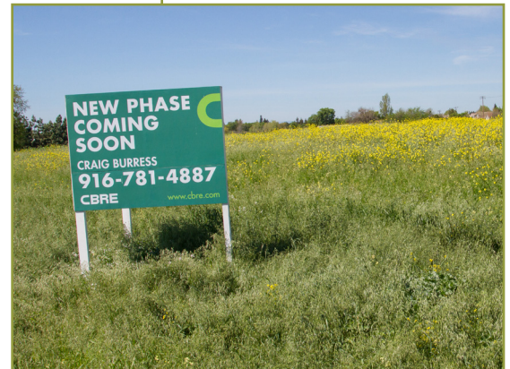
Development in Elk Grove

It is part of Elk Grove's vision to play a unique and active role in the region. In terms of the economy, that goal consists of two parts. First, Elk Grove seeks to better establish itself in the regional market as an activity and employment center by attracting additional high-quality jobs, enhanced amenities, visitation, and additional tax revenue to the City. Second, Elk Grove seeks to support the economic growth, circulation, and sustainability goals established for the region. To achieve the former, the City will encourage the growth of businesses in targeted industries and at targeted locations by providing a regulatory framework, business support, and infrastructure to attract these new businesses. To achieve the latter, in addition to local activities, the City will work to meet the goals set by regional plans.