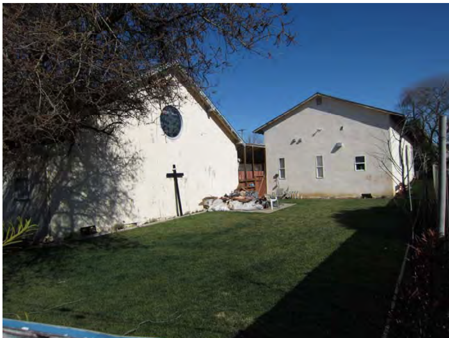
View of south (rear) façade of the church and east façade of the ancillary building (Page & Turnbull, 02/2012)