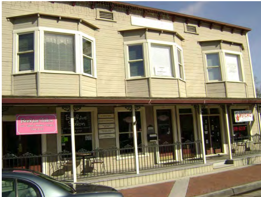
Detail view of south facade (Page & Turnbull, 02/13/2012).