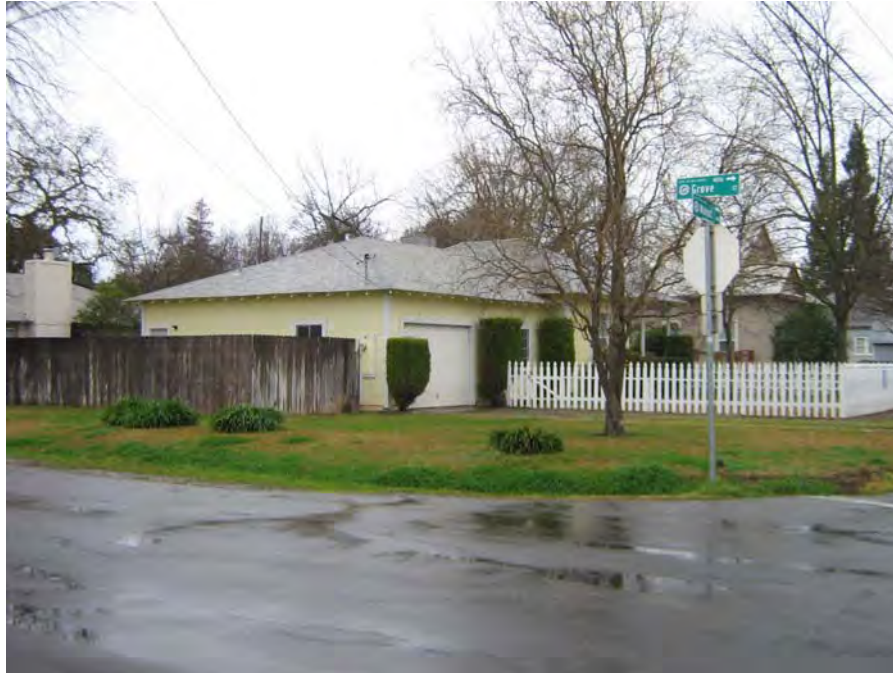
View of south and east facades (Page & Turnbull, 02/13/2012).