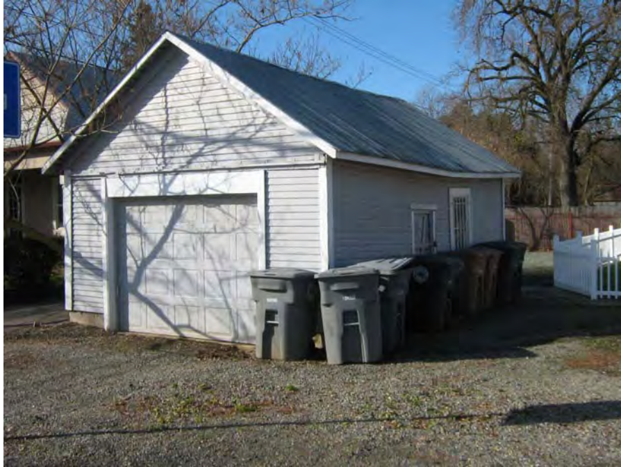
View of north and east facades of the garage.