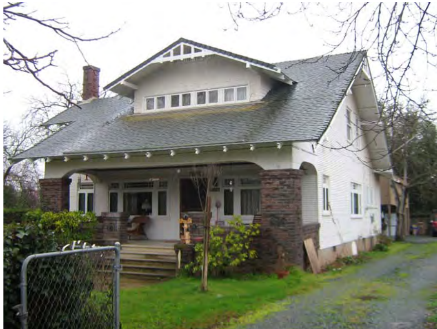
View of north and west facades.