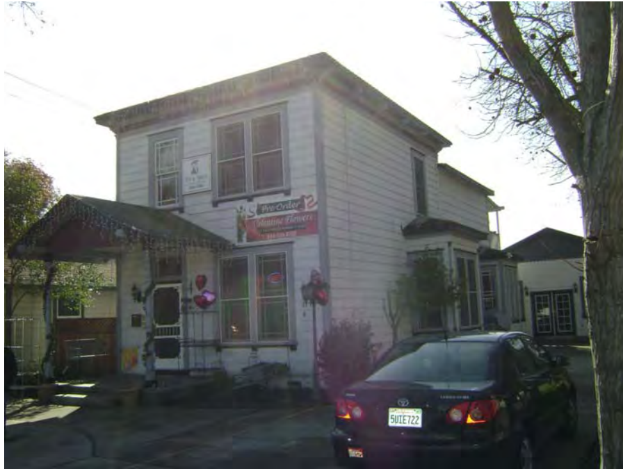
Partial view of oval pool in Hippo Exhibit (Page & Turnbull, 11/2008).