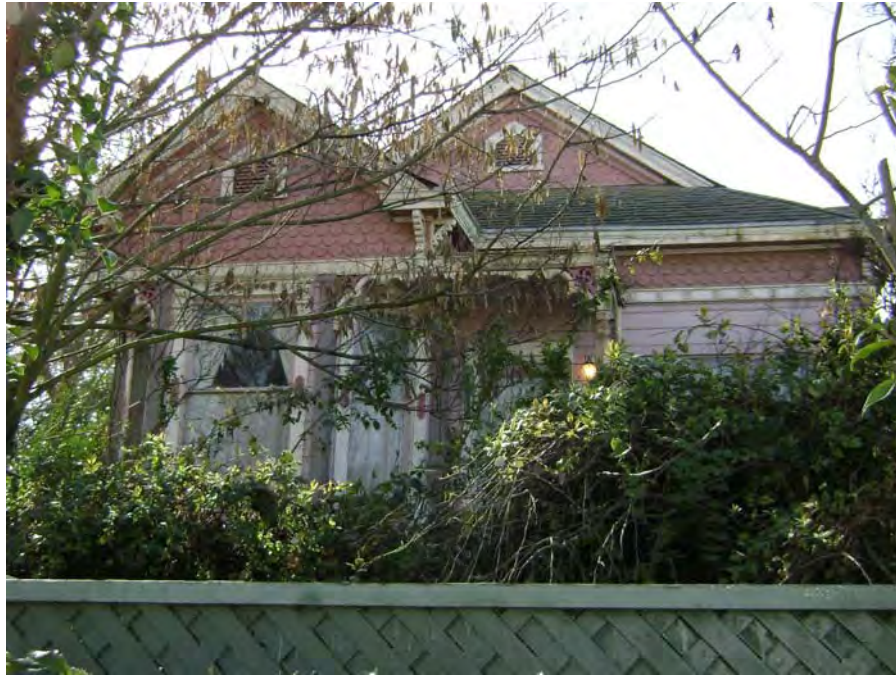
View of west facade (Page & Turnbull, 02/13/2012).