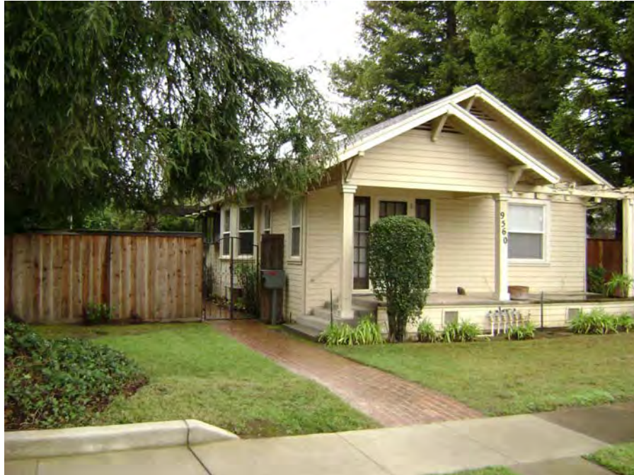
View of east (primary) and south (side) facades (Page & Turnbull, 02/13/2012).