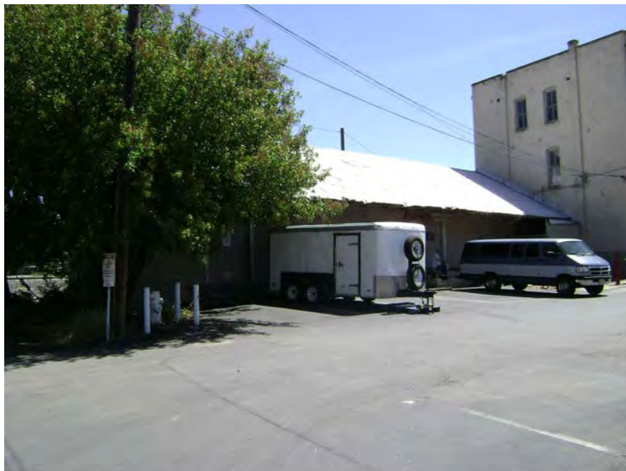
View of south and west facades 02/13/2012