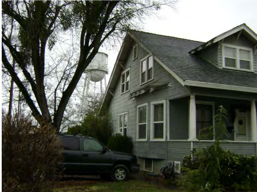
Partial east and south façades (Page & Turnbull, 02/13/2012).