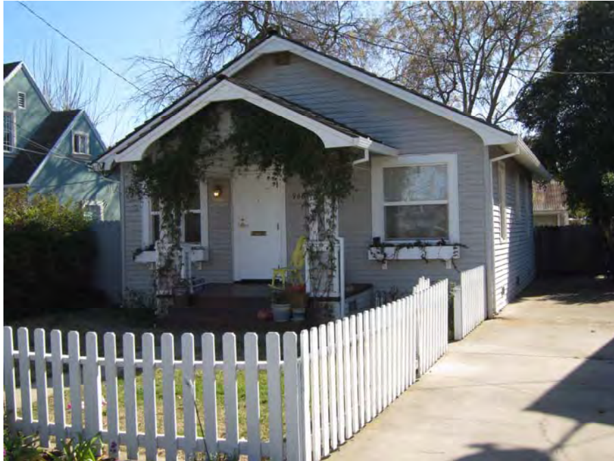
View of north and west façades (Page & Turnbull, 02/2012).