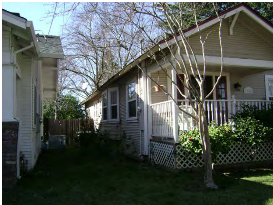
View of south facade.