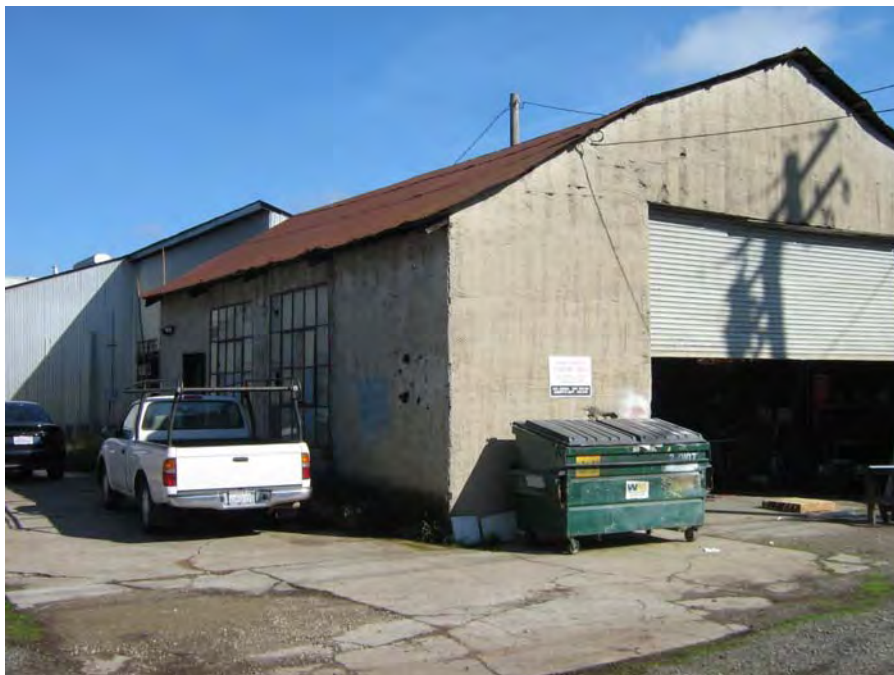
Southwest view of sheds at rear of main building from alley (Page & Turnbull, 02/13/2012).