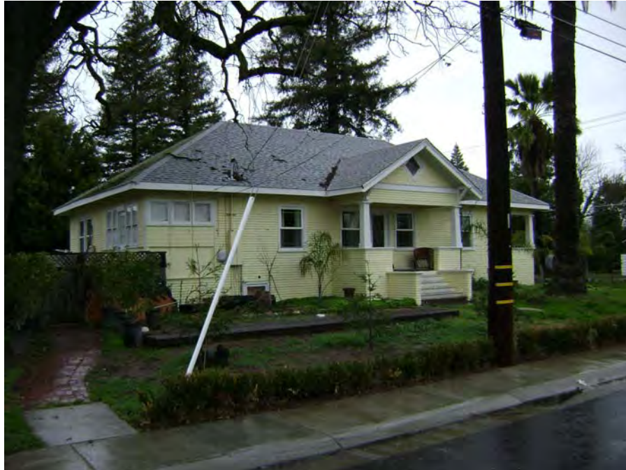
West and south (Locust Street) facades (Page & Turnbull, 02/13/2012).