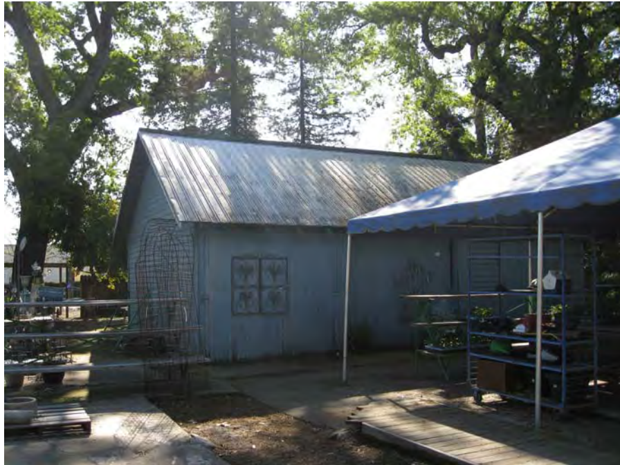
View of shed north of house (Page & Turnbull)