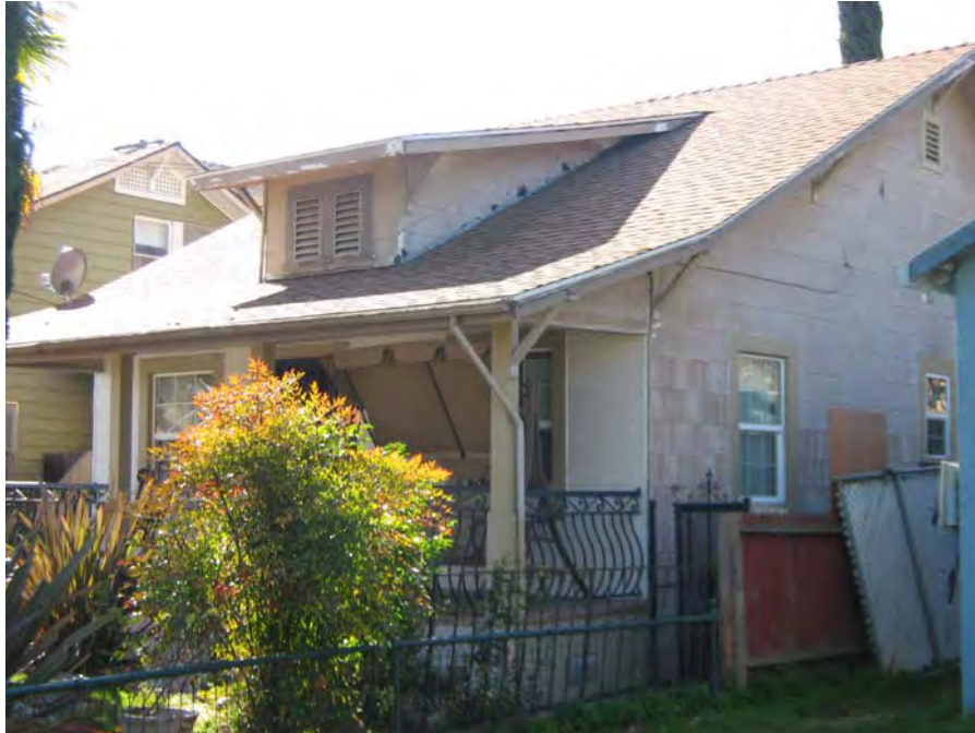
View of north and east facades (Page & Turnbull, 02/15/2012).