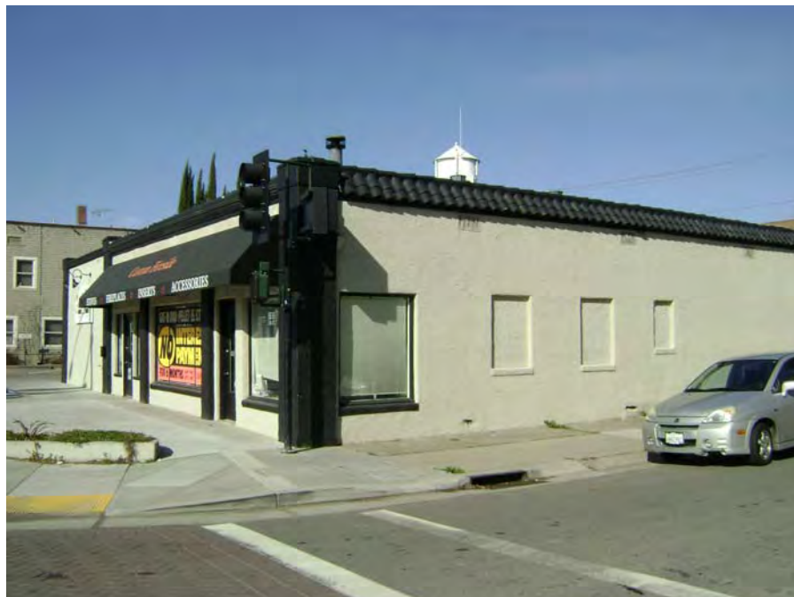
View of south (primary) and east (School Street) façades (Page & Turnbull, 02/13/2012).