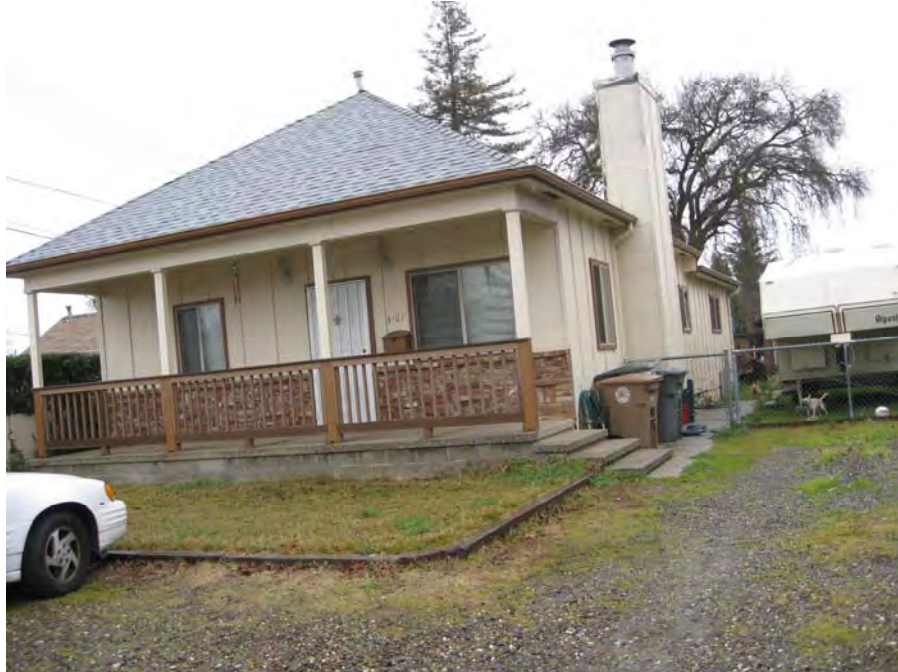
View of south and east facades (Page & Turnbull, 02/13/2012).