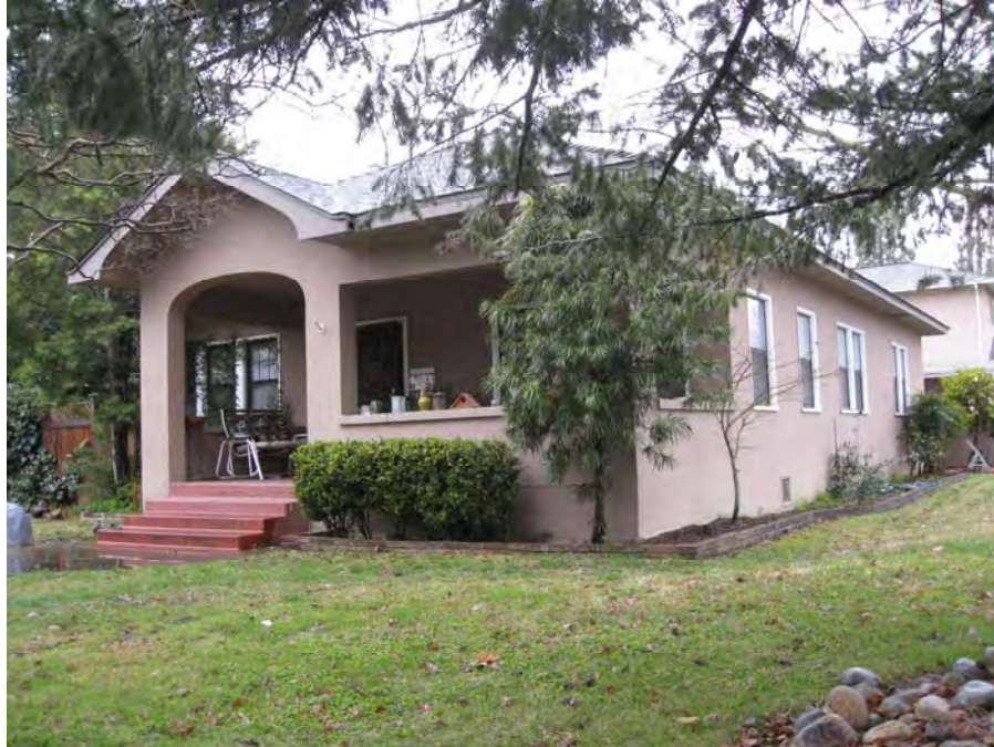
Northeast corner of 9620 Gage Street (2/2012).