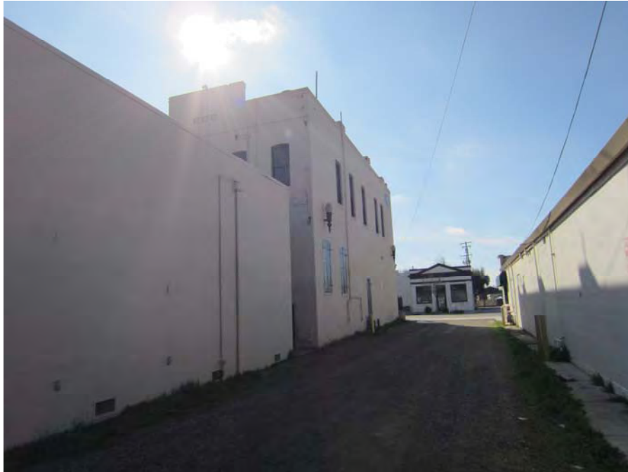
View of north and west facades (Page & Turnbull, 02/2012).