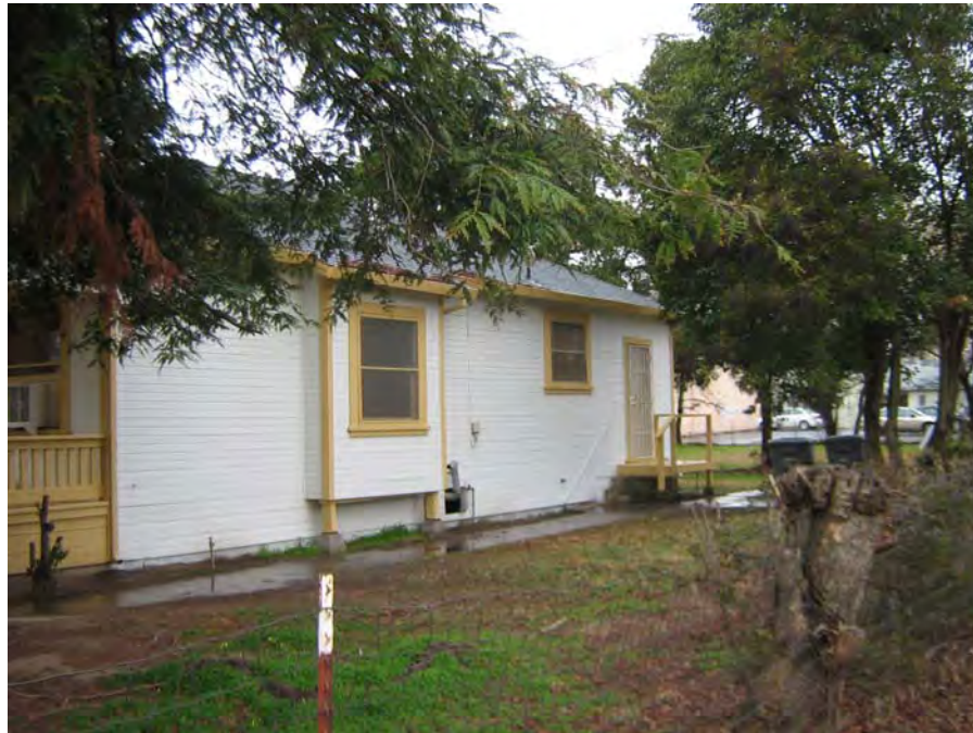
View of east façade