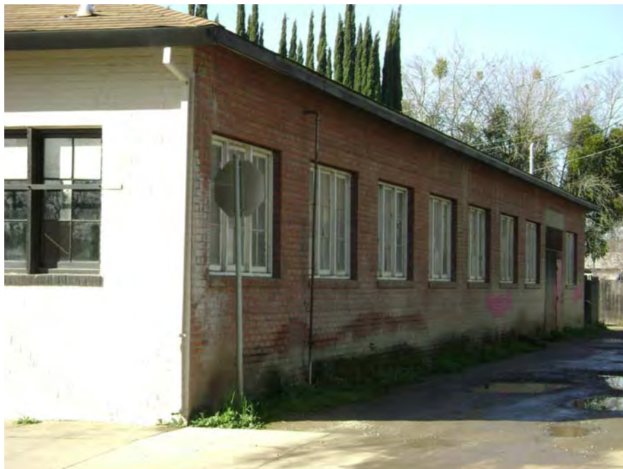
View of north (rear) façade.