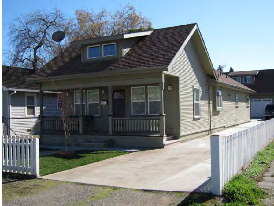
View of north and west façades (Page & Turnbull, 02/2012).