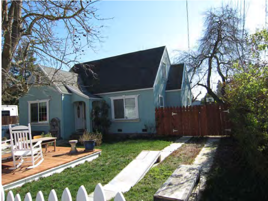
View of north and west façades (Page & Turnbull, 02/2012).