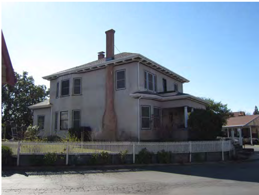
View of north and west facades (Page & Turnbull, 02/2012)