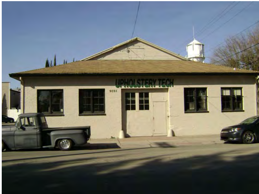
View of east (School Street) façade (Page & Turnbull, 02/13/2012).