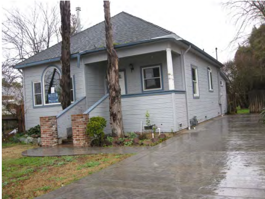
View of south and west facades (Page & Turnbull, 02/13/2012).