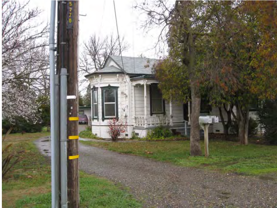
View of south and partial west facade (Page & Turnbull, 02/13/2012).