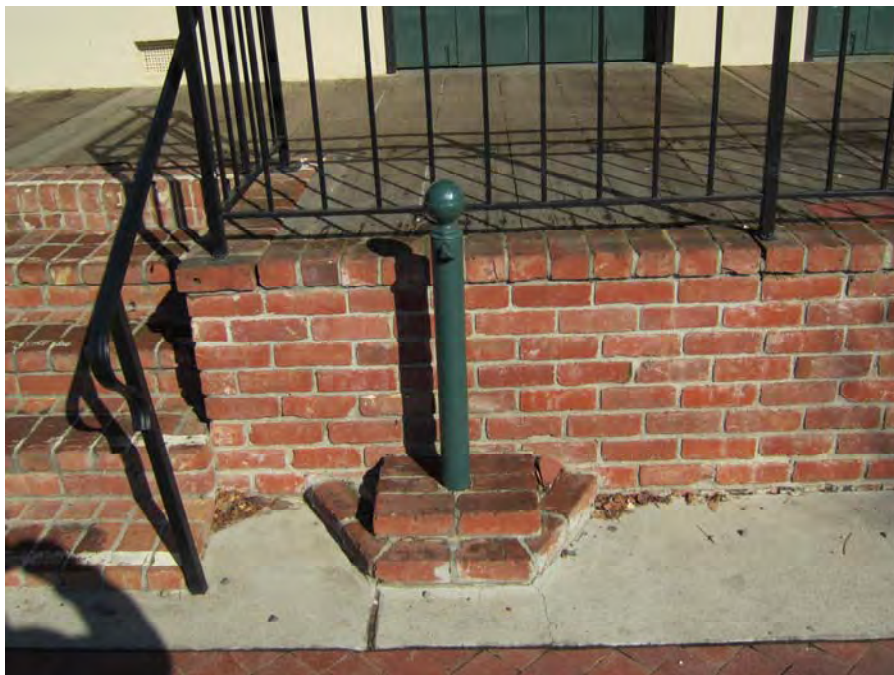
View of hitching post at primary (south) façade (Page & Turnbull, 02/2012).