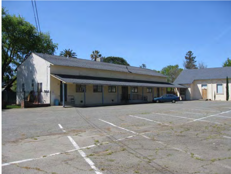
View of north and west façades (Page & Turnbull, 04/2012).