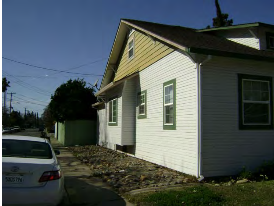
View of south facade.