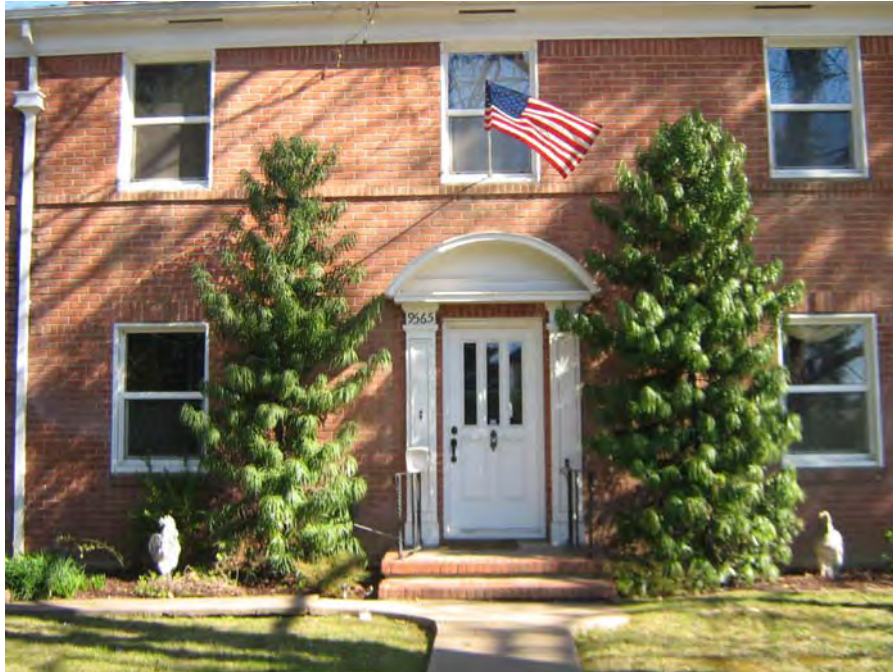
Detail view of west facade entrance (Page & Turnbull, 02/15/2012).