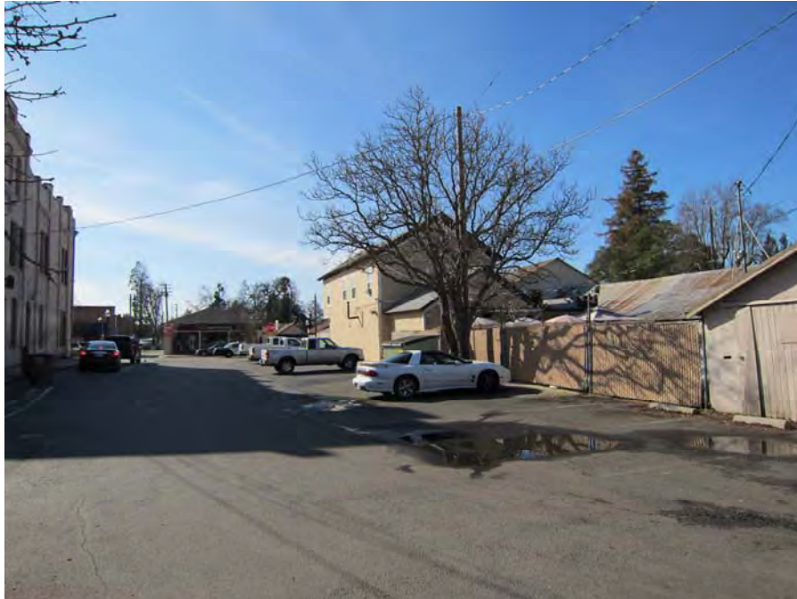
View from alley of north and west facades.