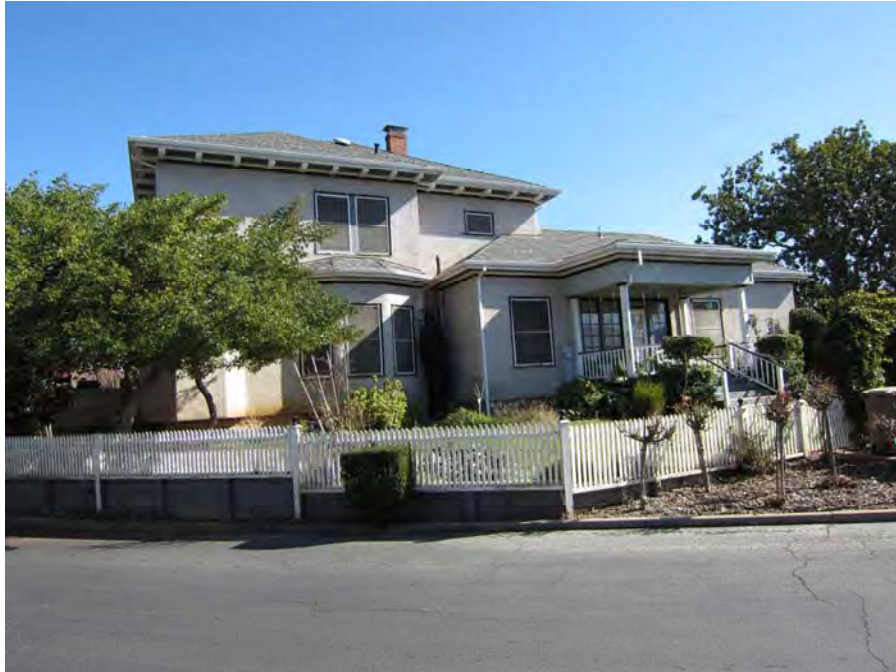
View of east façade (Page & Turnbull, 02/2012).