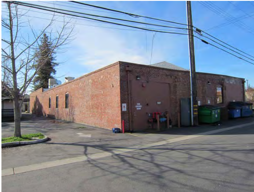
View of north and east façades (Page & Turnbull, 02/13/2012).