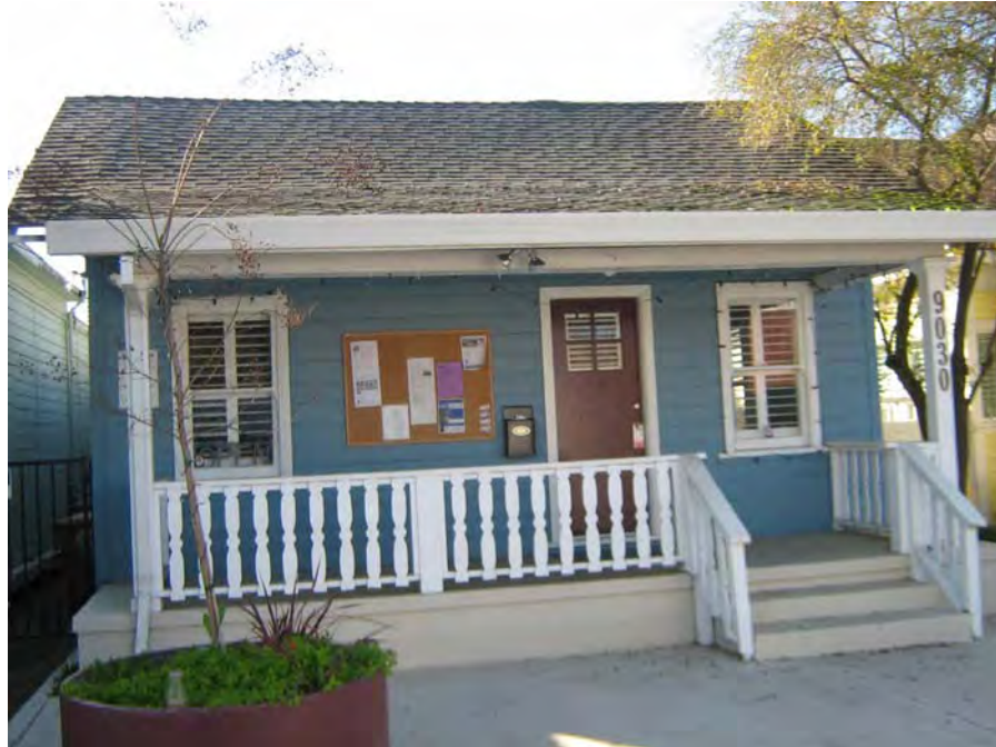
View of north facade (Page & Turnbull, 02/13/2012).