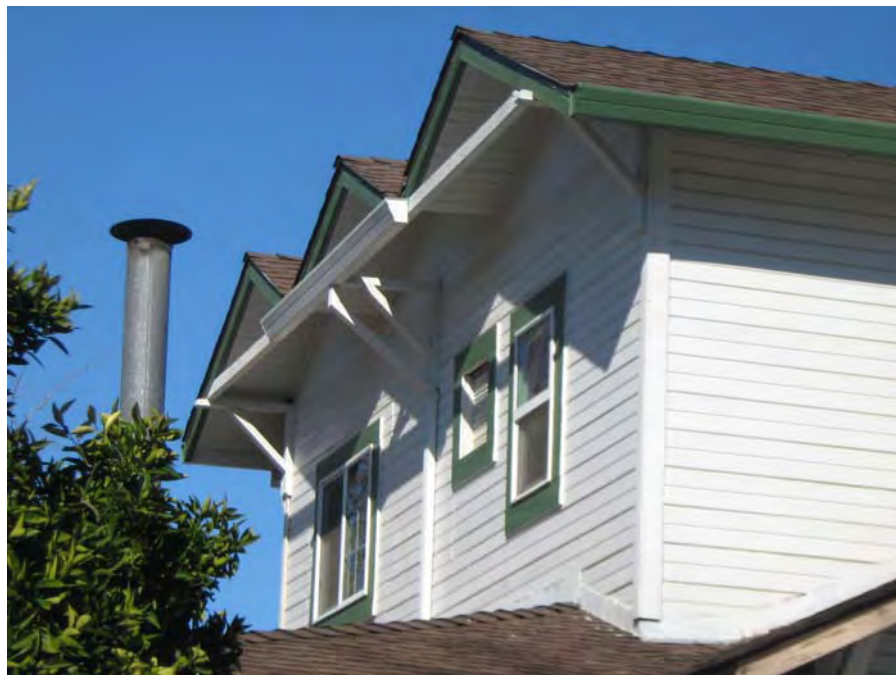
Detail of triple dormer at west facade (Page & Turnbull, 02/15/2012).