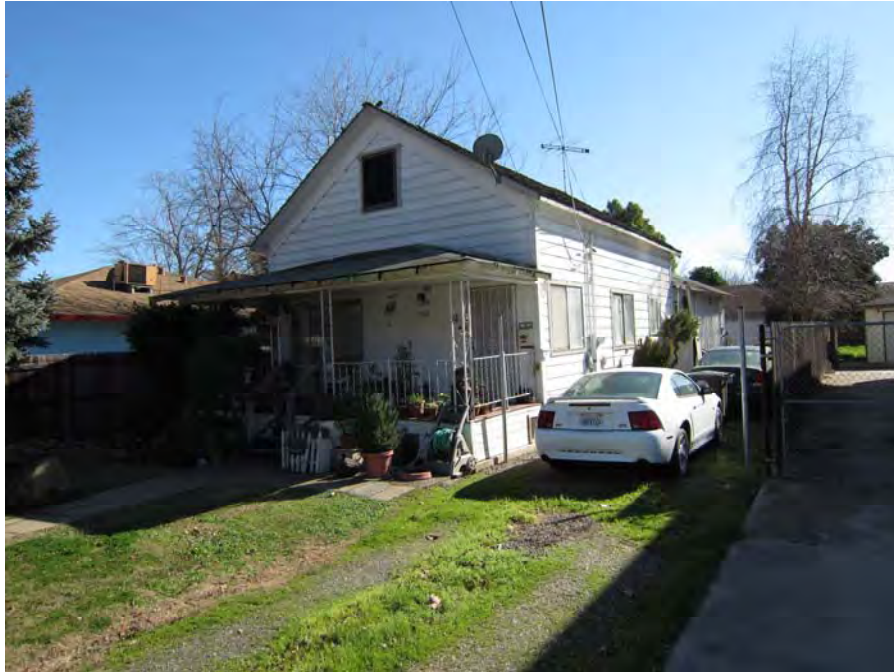
View of north and west façades (Page & Turnbull, 02/2012).