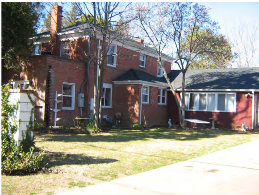
South and east facades with rear addition (Page & Turnbull, 02/15/2012).