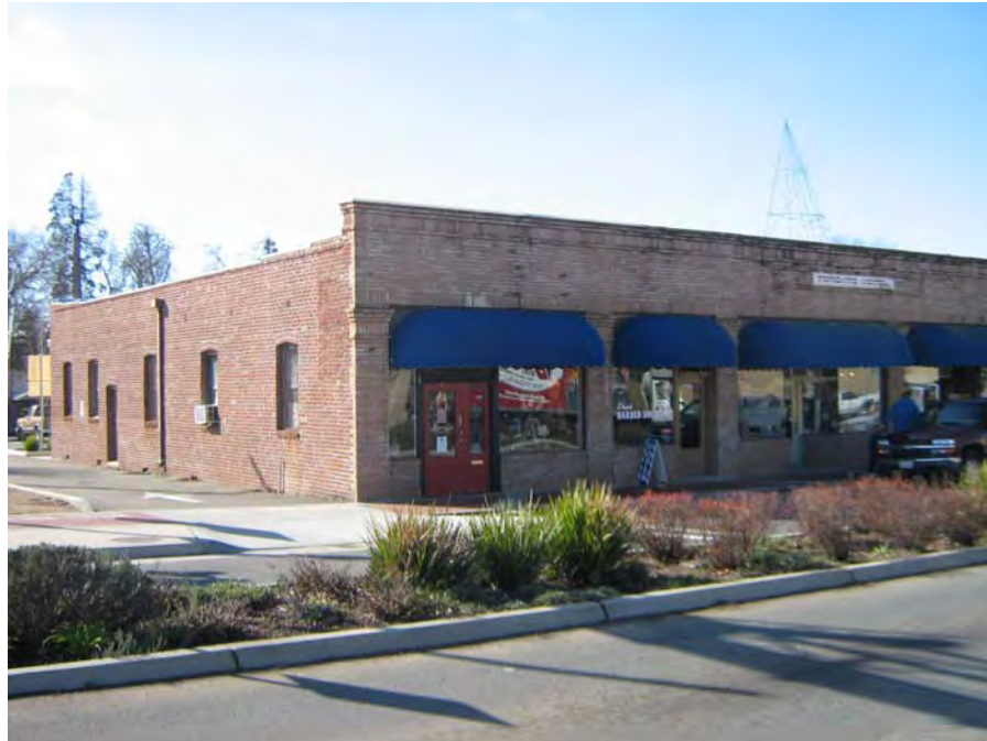
View of north and east facades (Page & Turnbull, 02/13/2012)