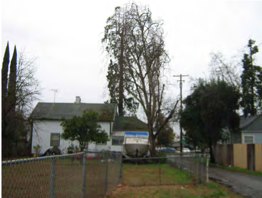
View of north façade from alley