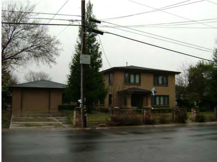
View of west (primary) façade (Page & Turnbull, 02/13/2012).