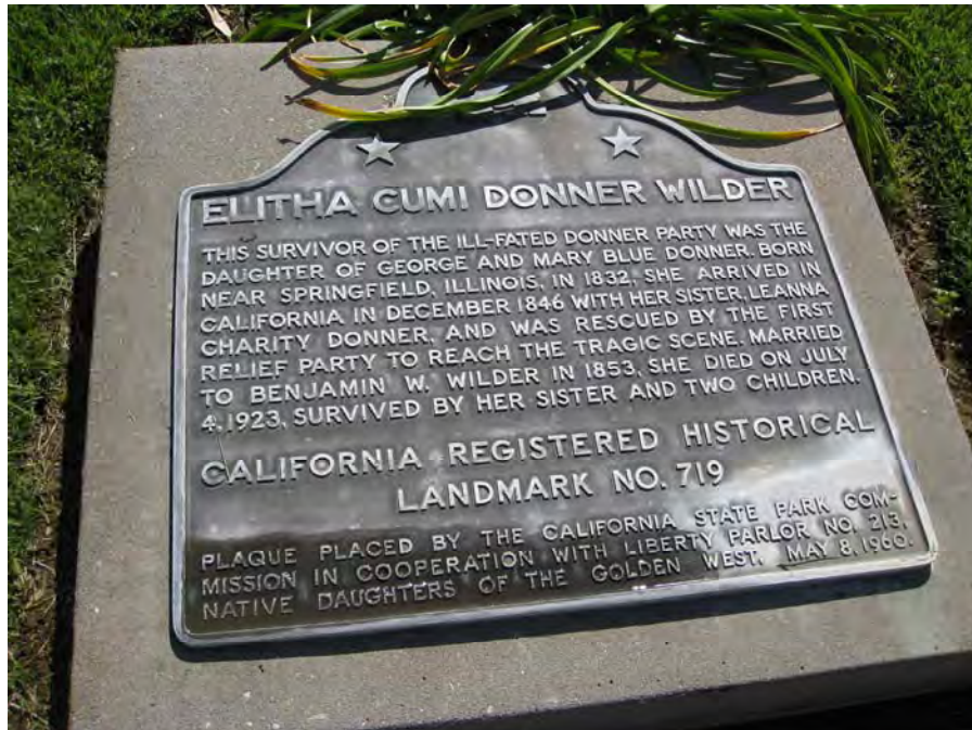
Gravesite of Elitha Cumi Conner Wilder (Page & Turnbull, 4/2012).