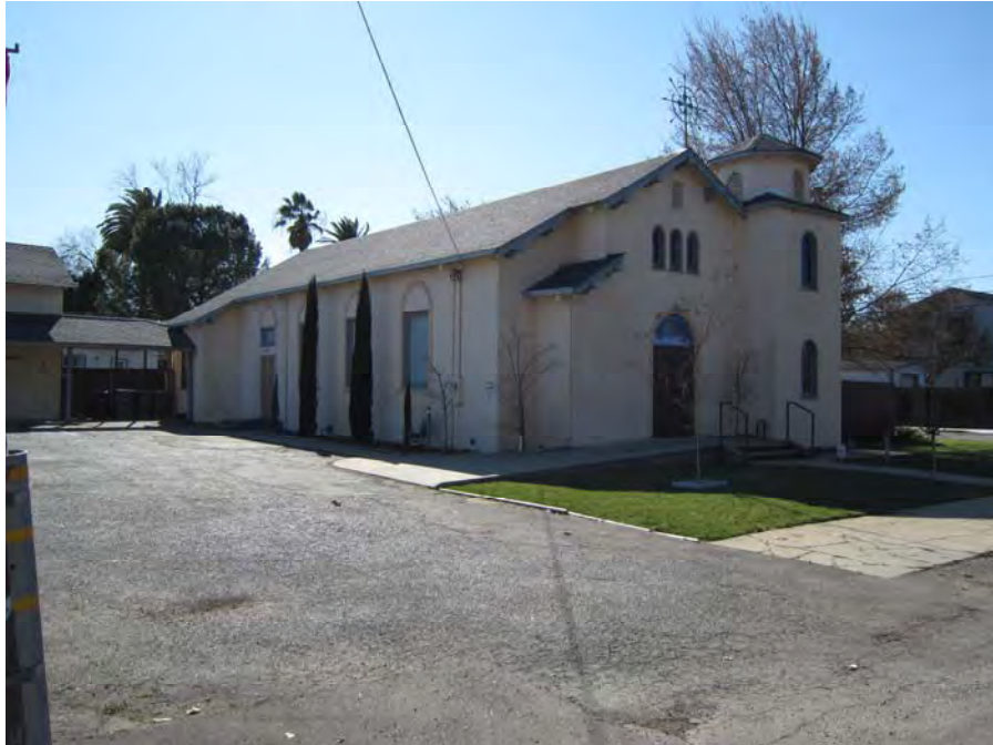
View of north and west façades (Page & Turnbull, 02/2012).