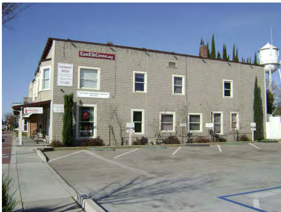
View of east facade.