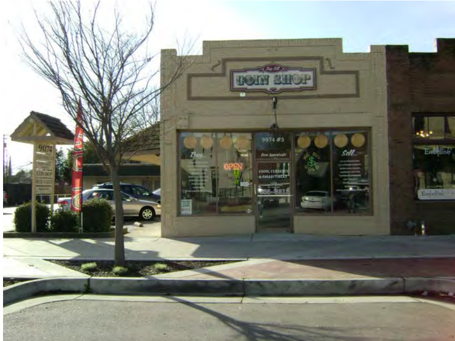
South facade (Page & Turnbull, 02/13/2012).