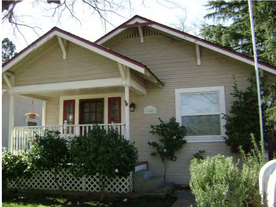
View of east facade.