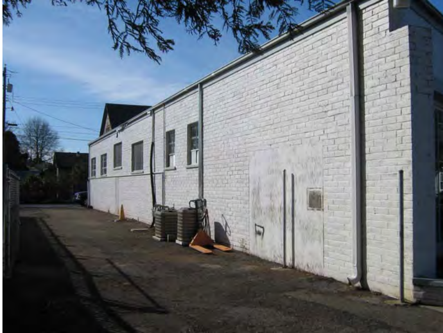
View of East façade (Page & Turnbull, 02/13/2012).