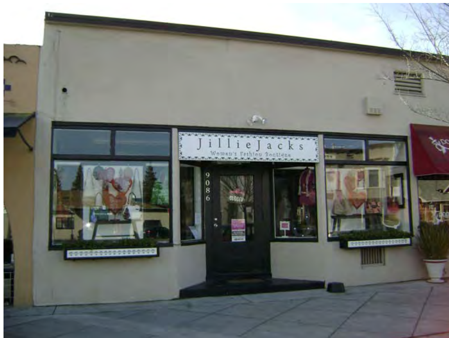
Detail view of 9086 (Page & Turnbull, 02/13/2012).