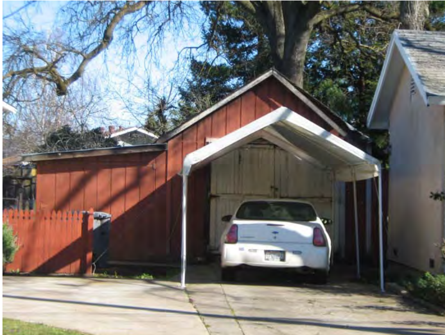
View of shed on north side of property (Page & Turnbull, 02/15/2012).