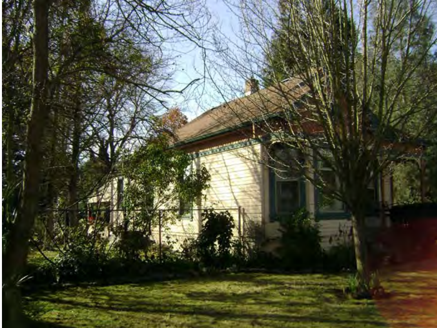
View of east and north facades (Page & Turnbull, 02/13/2012).