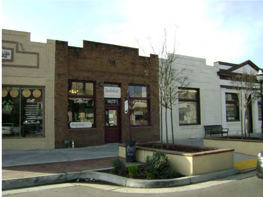
View of south facade (Page & Turnbull, 02/13/2012).