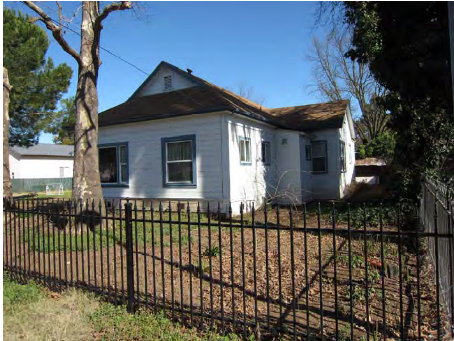
View of east (rear) and south façades (Page & Turnbull, 02/2012).