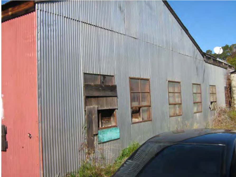
South east view of shed at rear of main building from alley (Page & Turnbull, 02/13/2012).