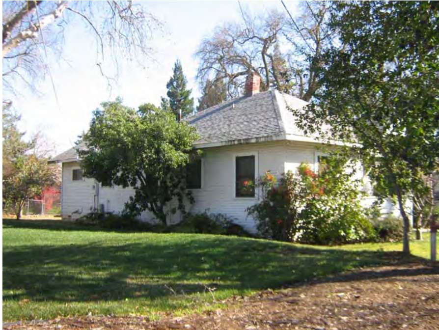
View of north facade (Page & Turnbull, 02/15/2012).