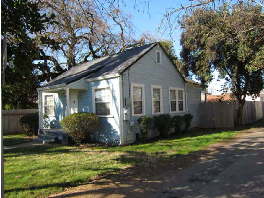
View of south and east façades (Page & Turnbull, 02/2012).