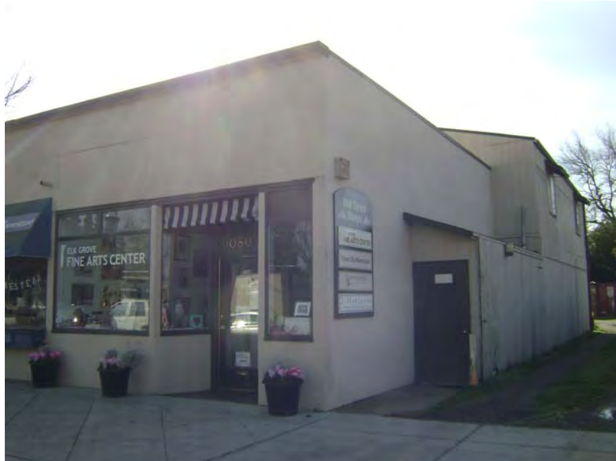
View of north and west facades (Page & Turnbull, 02/13/2012).