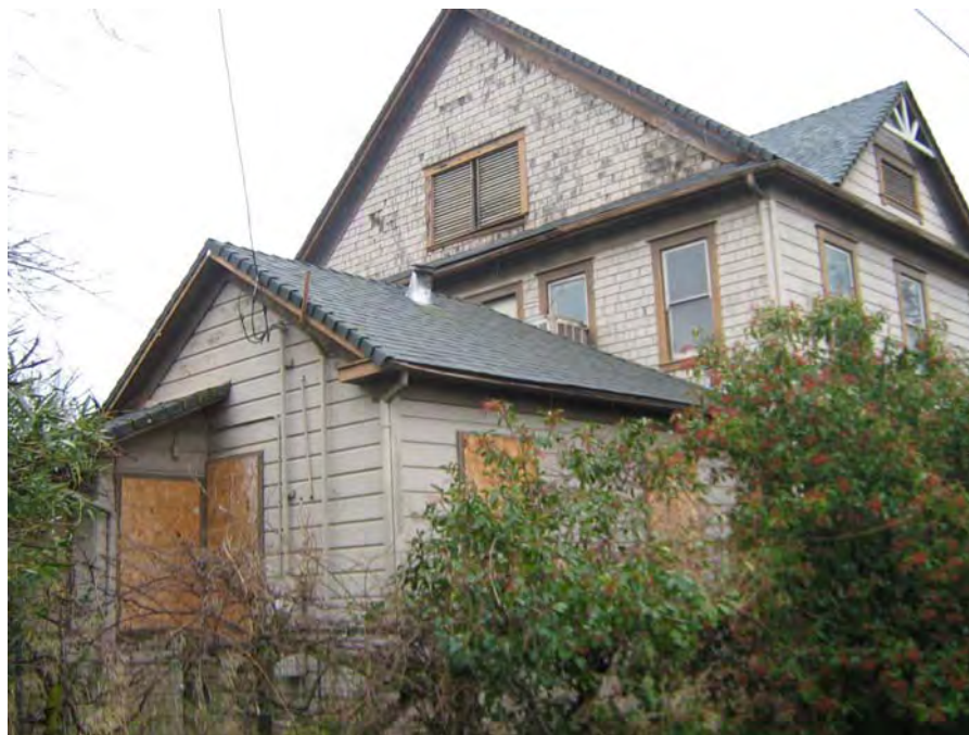
View of east (rear) and north facades.