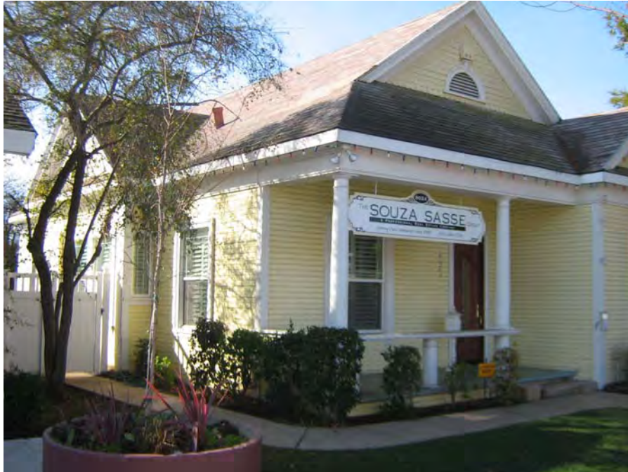
View of north and east facades (Page & Turnbull, 02/12/2012).