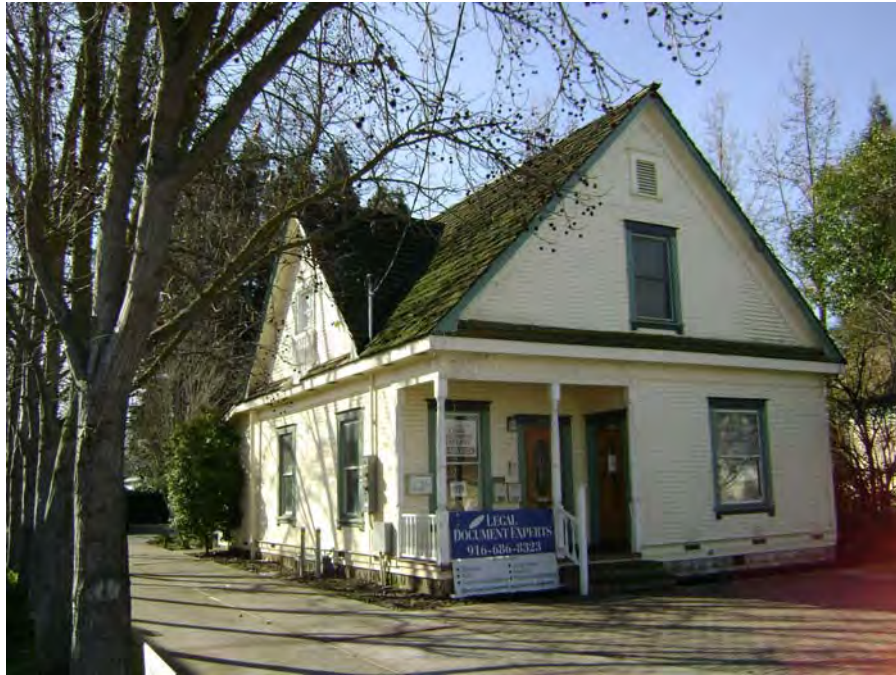
View of north and east facades (Page & Turnbull, 02/13/2012).