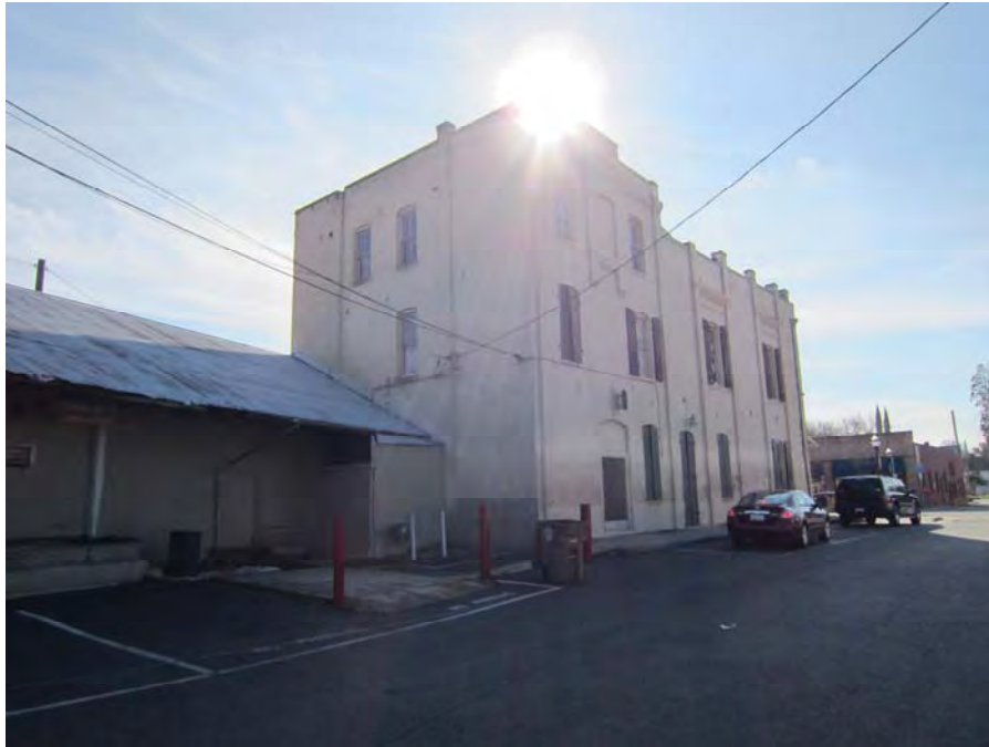
View of north and west facades of IOOF Building and neighboring warehouse building (Page & Turnbull, 02/13/2012).