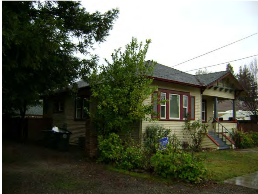
Southeast corner of 9548 School Street (02/2012).