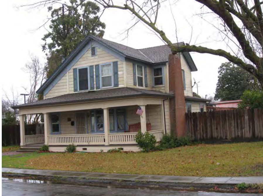
Southwest corner of 9625 Gage Street (2/2012).