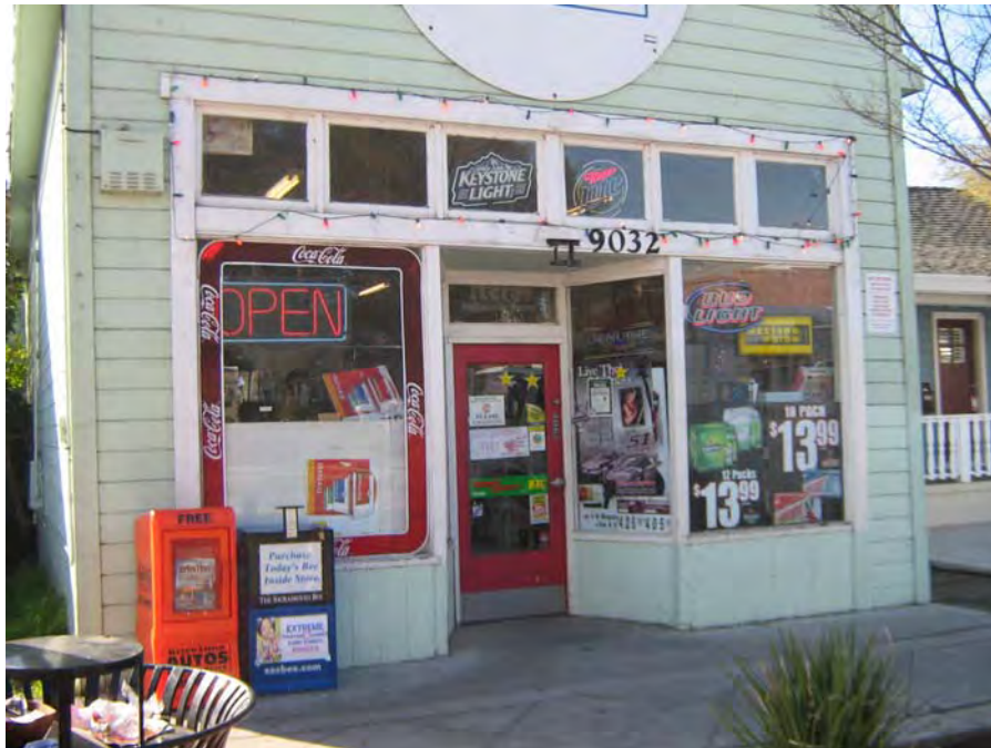
Detail view of north facade storefront (Page & Turnbull, 02/13/2012).