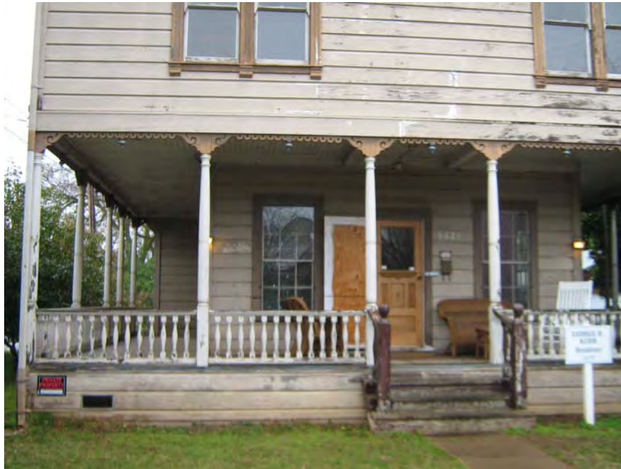
Detail of west (primary) facade.