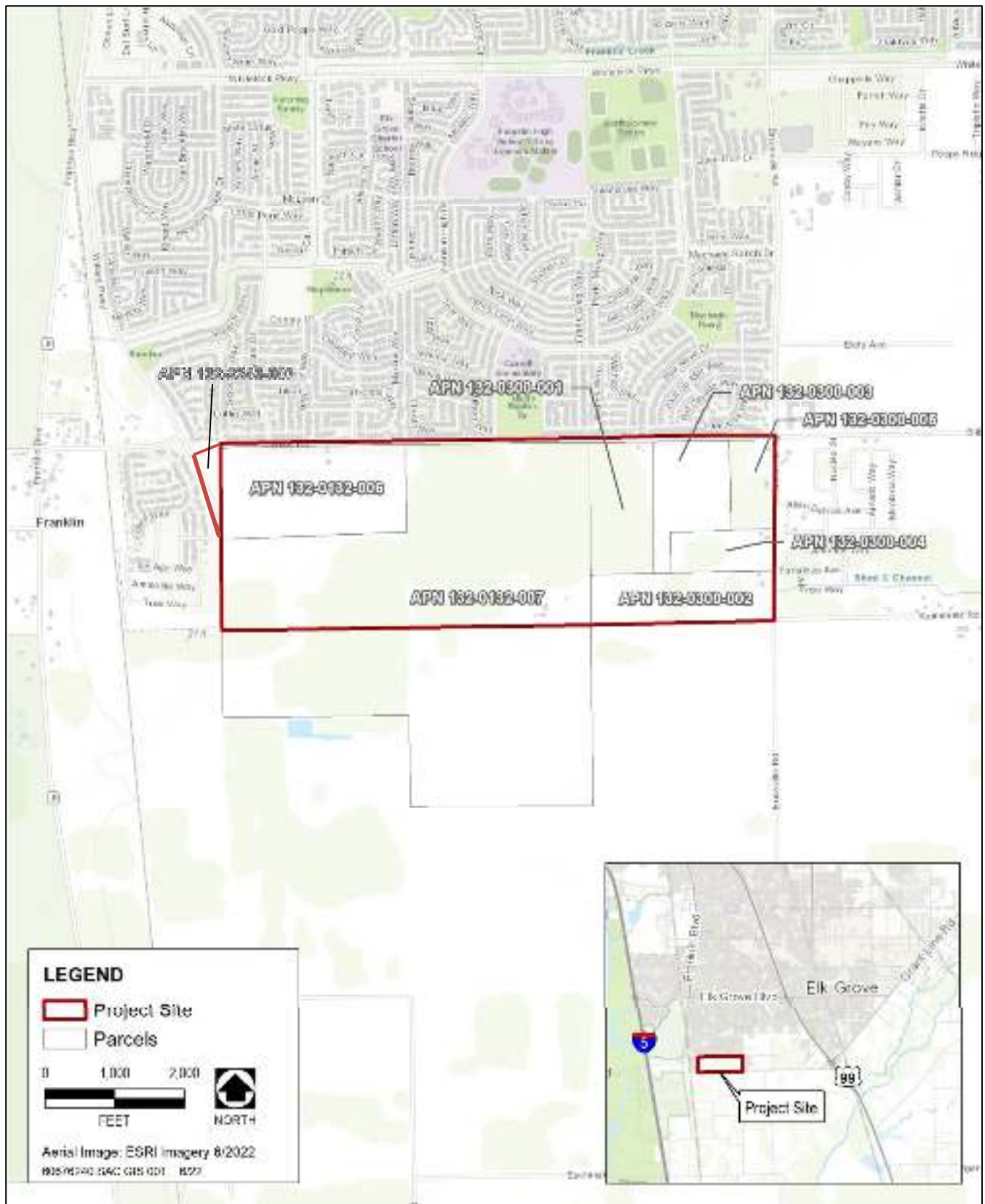
Exhibit 1 - Project Location