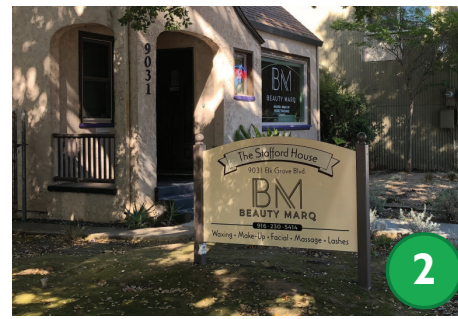
Freestanding Metal Sign