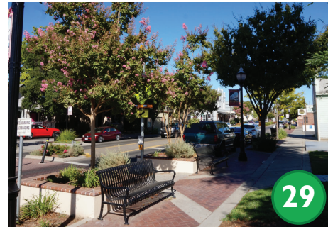
Paving and Streetscape