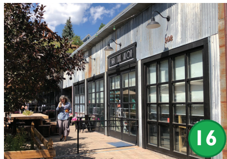
Storefront Pattern, Rhythm