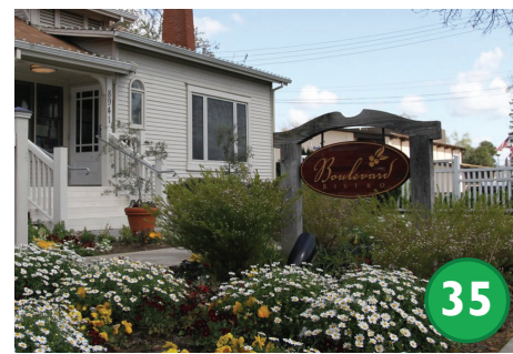
Freestanding Business Sign