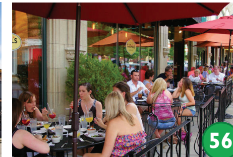
Restaurants, Outdoor Dining