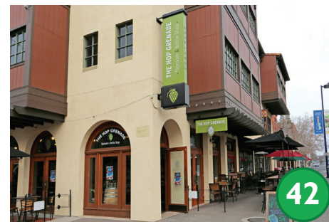
Contemporary Use of Traditional Materials