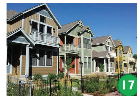
Small Lot Single Family