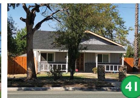
Single Family Homes