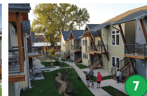
Apartments or Condos