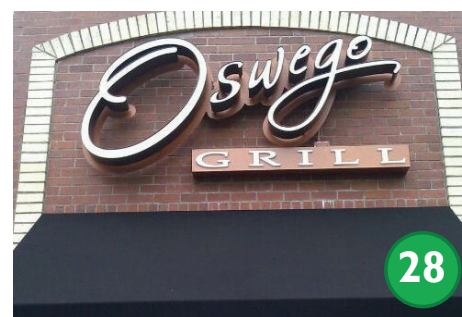
Channel Letter Signs