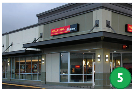
Tile and Metal