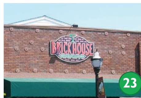
Attached Building Sign