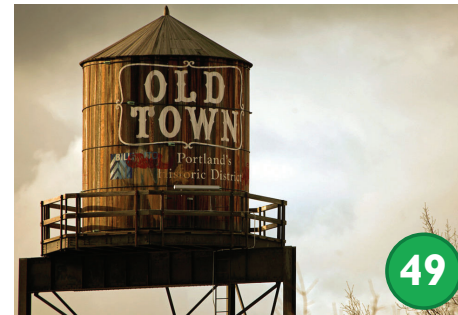
Historic, Water Tower Sign