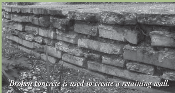
Broken concrete is used to create a retaining wall.