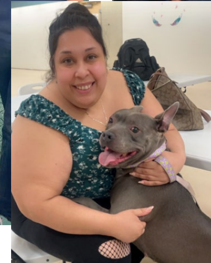
Shelter guests who found permanent housing