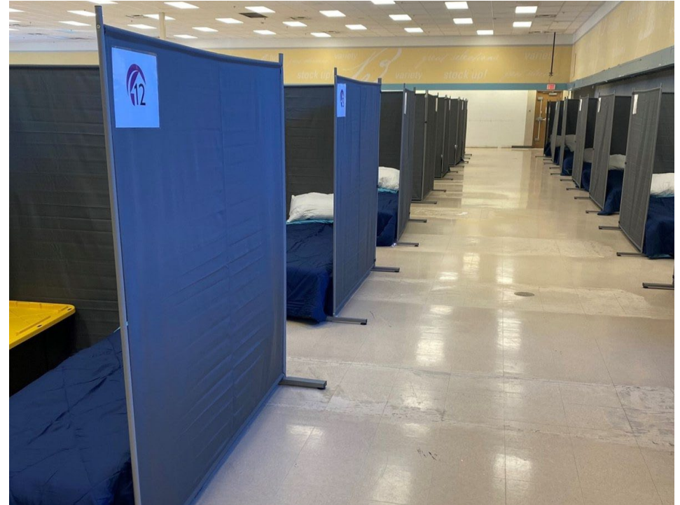
Winter Sanctuary interior