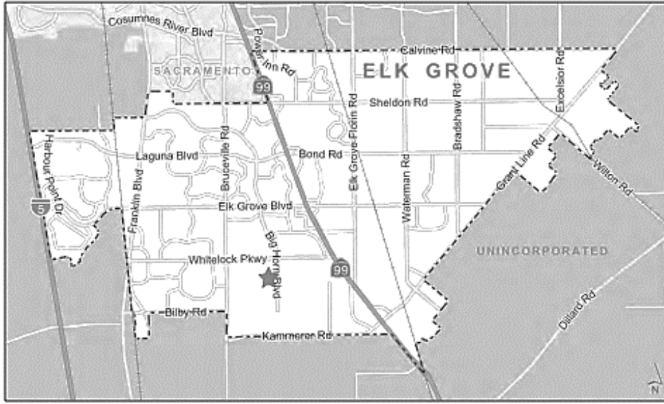
Figure 1 – Vicinity Map