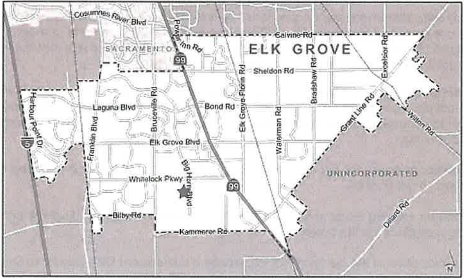
Figure 1 - Vicinity Map